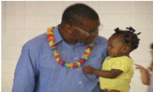
Having fun together!

Our goal is to provide educational, child friendly toys, books and resources to all families in the Hickman Mills community.