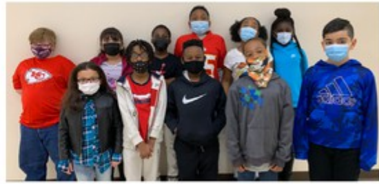
Ingels LEGO League