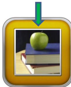
Student Fee Payments