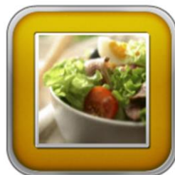
Staff Food Service